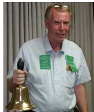
Meeting being called to order! The BELL gains the crowd's attention.