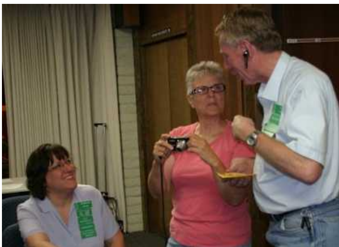
During the break a little conversation about a different kind of genealogy – AKC.