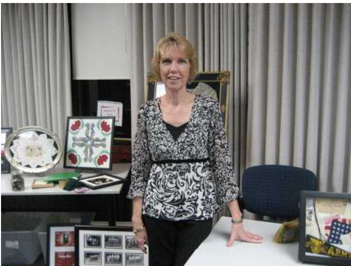
Toni spoke on Show off your Stuff: Displaying Family Heirlooms